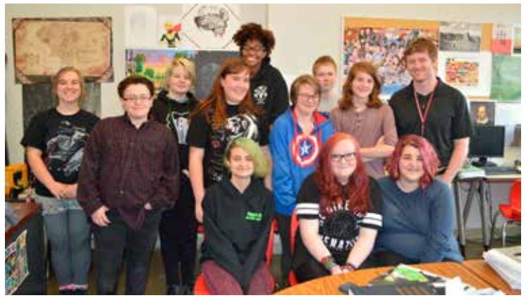
13 ACT students were recognized by UCONN's prestigious Connecticut Writing Project for the quality and creativity of their written works.