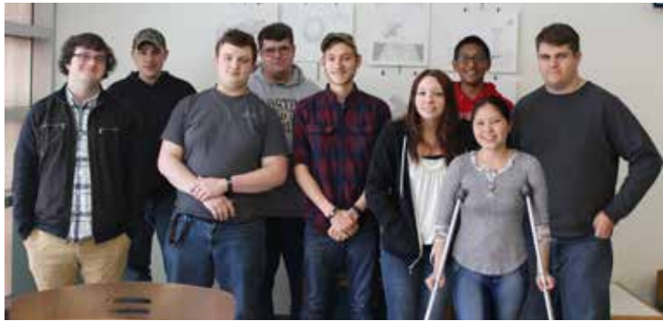
QMC students took 1st place in the Third Annual Eastern Advanced Manufacturing Alliance Video Challenge and Film Festival.

Annually, high schools across eastern Connecticut partner with local manufacturers to produce a video that will educate students and communities about how manufacturing companies are changing through the use of technology, new skills and systems. Nearly 100 students across 14 high school teams participated in the 2017 challenge.