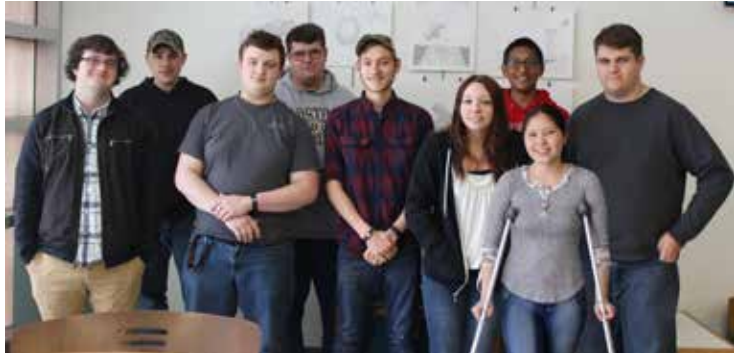
QMC students took 1st place in the Third Annual Eastern Advanced Manufacturing Alliance Video Challenge and Film Festival.

Annually, high schools across eastern Connecticut partner with local manufacturers to produce a video that will educate students and communities about how manufacturing companies are changing through the use of technology, new skills and systems. Nearly 100 students across 14 high school teams participated in the 2017 challenge.