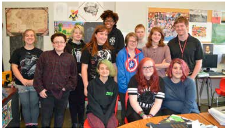
13 ACT students were recognized by UCONN's prestigious Connecticut Writing Project for the quality and creativity of their written works.